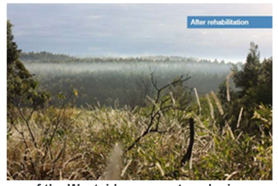
Figure 3: Before (left) and after (right) closure of the Westside open cut coal mine.

The rehabilitated areas have been assessed annually to develop detailed records of the progress of the rehabilitation works. These records include revegetation germination rates, the presence of second generation seedlings, plant health and the success or failure of rehabilitation management. In sufficiently mature areas (three or more years) monitoring of the floristic and structural composition of rehabilitated land has been undertaken using standard methods employed by New South Wales government agencies.