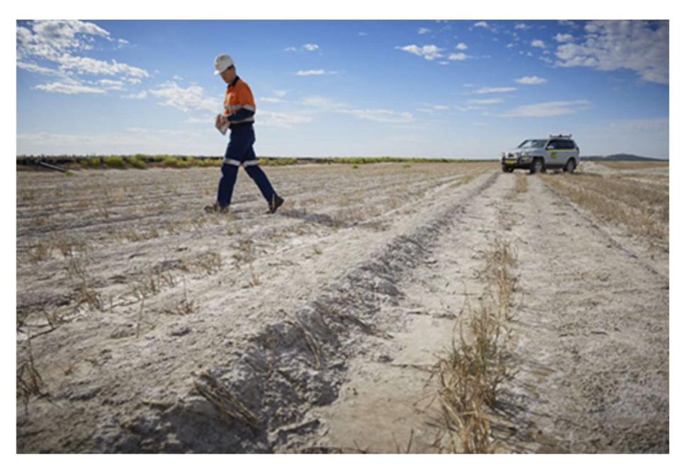
Figure 7: Barley cropping trials on tailings at Northparkes.

Planting a crop directly on tailings dams to manage dust is an industry first, and consequently, the outcomes were unknown. However, the results of the barley crop and other dust management techniques speak for themselves. There has been no dust lift-off from the areas of the tailings dams included in the trials since sowing in April 2016. Today, barley covers 65 per cent of the tailings dams and Northparkes has significantly reduced the chance of future dust lift off for the community.