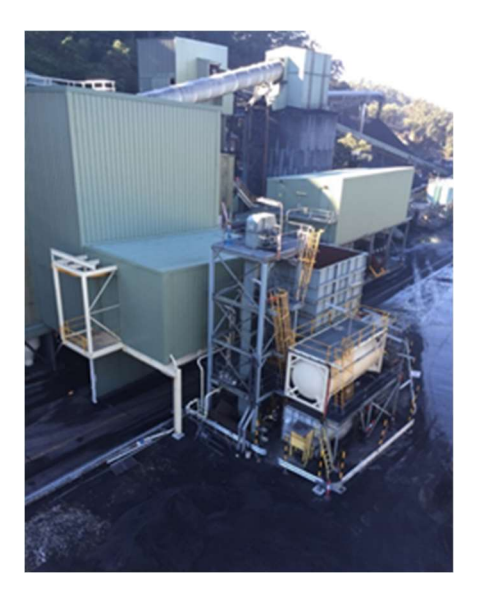
Figure 8: Surface UG Emplacement Backfill Plant Construction Complete July 2016 at Peabody Energy.

Following emplacement of CWR and optimisation of systems performance, work is scheduled for upgrades to the plant in 2018 to allow the disposal of 100% of CWR underground by 2021.