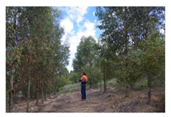
Figure 2: Rehabilitation progress at 2 years (left) and 7 years (right) at Boggabri Coal Mine.

Approximately 111 ha of overburden emplacement area has been rehabilitated to date. The final landform includes proposed rehabilitation of: