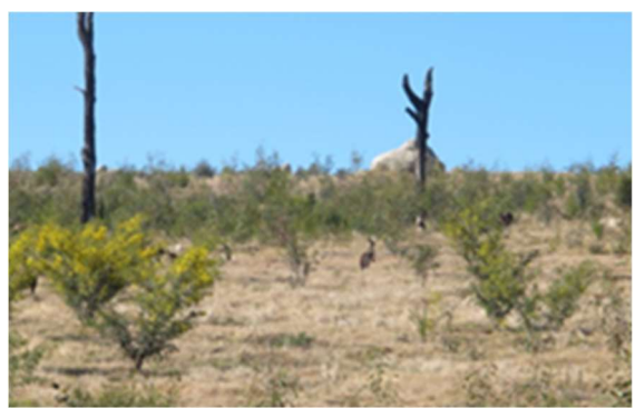
Figure 11: Natural landform rehabilitation at Mangoola Coal