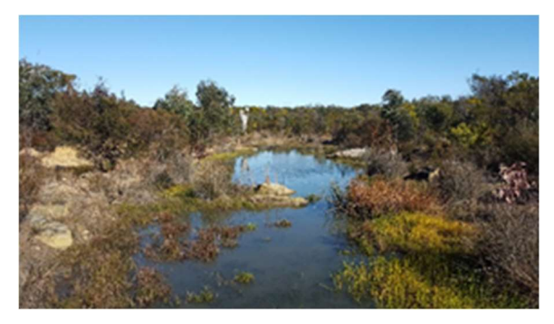
Figure 5: Waterhole constructed in 2007 to provide fauna habitat at South 32 Illawarra.

Many species have seeded multiple times and young germinates are evident. This indicates that the stand will be self-sustaining over time and seed fall will provide insurance if the area is inadvertently burnt in a wildfire.