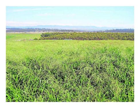
Figure 6: Rehabilitation trials involving organic waste by-products at Rix's Creek.

The biosolid amended plot also produced the comparable green leaf production and more than 4 times greater metabolisable energy after 24 months. Indicative pasture productivity and stocking rates are approximately two to three times higher than native pasture. The trial demonstrates the benefits of biosolid amendment to low-fertility soils.