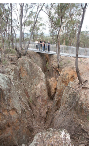
Figure 1: Peak Hill Open Cut Gold Mine Experience

Sediment ponds are effectively ephemeral wetlands. Thousands of planted trees and shrubs provide valuable woodland habitat on what was previously cultivated farmland. In 2016, Alkane gifted four hectares of land (Contractor's area) to Parkes Shire Council (PSC) to establish a waste transfer station. PSC were able to take advantage of the infrastructure (power, water and shed) made available by the mine.