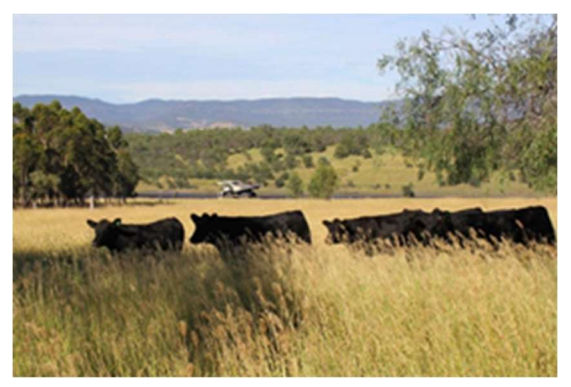
Figure 10: Grazing trial steers yarded for regular weighing (left) and rehabilitated mine land at Hunter Valley Operations used for grazing trials.