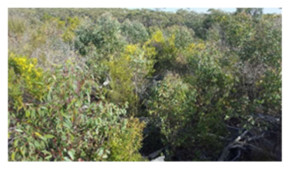
Figure 4: Examples of rehabilitation after 2 years (left) and 8 years, showing dense cover of canopy species at South 32 Illawarra.

Habitat reinstatement undertaken includes: transplanting dead stag trees; habitat logs and woody debris; nest box use; and reconstruction of rock outcrops and waterholes.